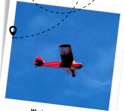
We had visitors