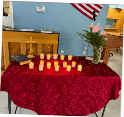
All Souls Day