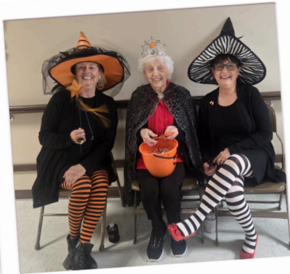
Halloween was a blast!