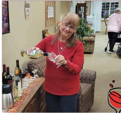
Fayette after 5