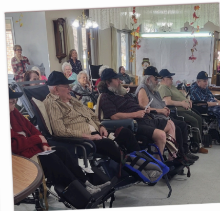
Veterans Day Program