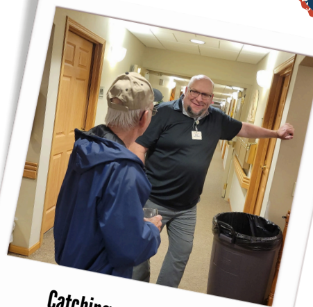
Catching up with old friends