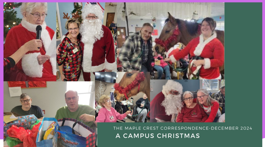
THE MAPLE CREST CORRESPONDENCE-DECEMBER 2024 A CAMPUS CHRISTMAS

Have a safe, happy and healthy holiday and new year!