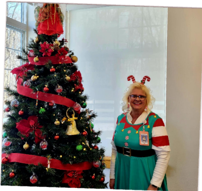
Jesup School donates to our campus