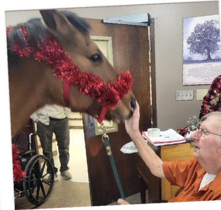
Who knew horses could come inside!