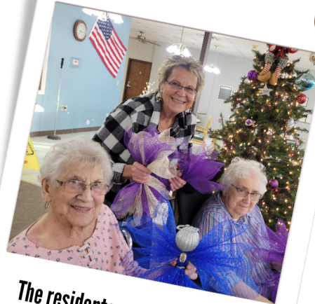
The residents made beautiful angels