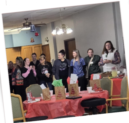
Staff had a blast at the party