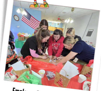
Employee Christmas Party